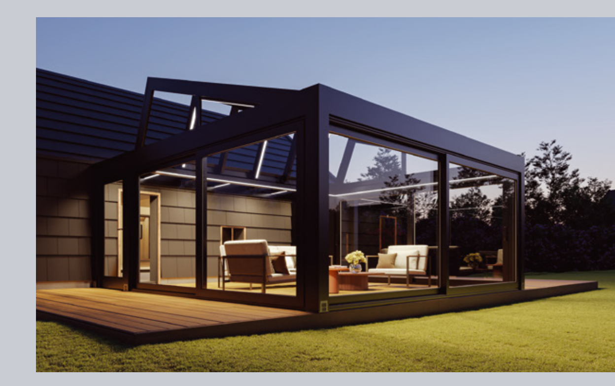
WINTERGARDEN / SUNROOM

There is no need to carry the realities in your dreams. Comfort wrapped in shield. Polad system, designed by talented Schildr engineers known for their innovative approaches, stands as a pioneering winter garden model that seamlessly blends classical and modern design elements. In many regions, the challenge of varying back heights during winter garden assembly is a common issue. Steel structure embedded in aluminum profiles addresses this concern by ensuring an equal load distribution across the floor, which makes it different from numerous other winter gardens. Depending on the spacing between the supports, it allows for a convenient connection of the system's perimeter with panoramic sliding systems. A well-conceived water channel integrated throughout the system efficiently and quietly directs excess water out through a plastic conduit. This model offers users superior comfort, clear panoramic views, excellent illumination, year-round usability, and direct communion with nature.